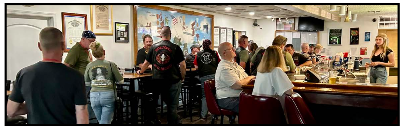
We open at 1:00 and close at 9:00 p.m. everyday except Monday.

Committee. I believe we work well together and will make a good team.